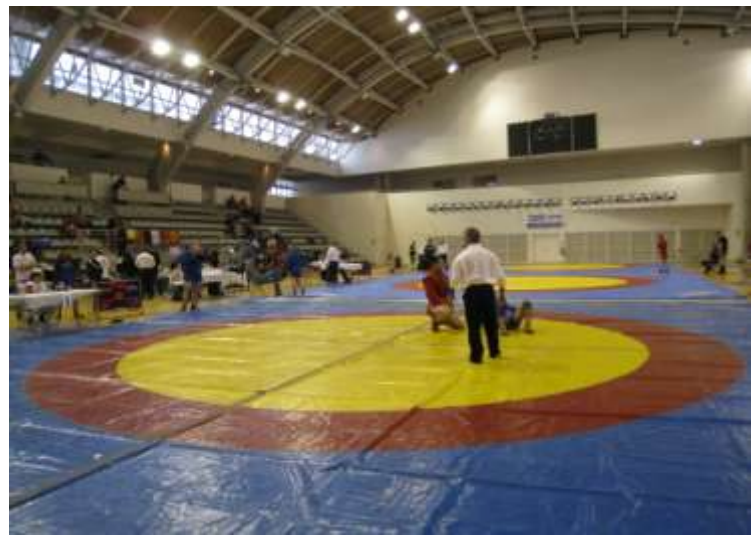
CHARLETY STADIUM- Charpy Room 17, avenue Pierre de Coubertin 75013 PARIS

To get to the Charléty Stadium, 17 avenue Pierre de Coubertin in 13<sup>th</sup> district, you can take the RER line B University Cité station or the buses number 21, 67, 88 and PC.